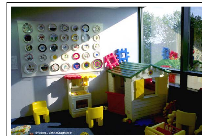
Southwest District Health launched a year-long campaign to educate daycare providers about immunization schedules, the law, and vaccine-preventable diseases.

In accordance with medical standards recognized by the Board of Medicine and the immunization recommendations available from the de-